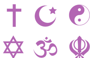
Religion or Belief