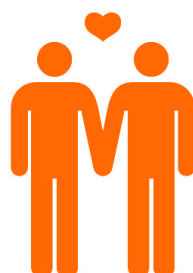
Marriage or Civil Partnership