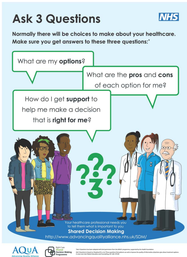
Figure 1 Ask 3 Questions (reproduced by kind permission of Advancing Quality Alliance).

knowledge and skills is justified. Some are prone to misrepresentation—accidentally or otherwise, this is readily identified through discussion and the underlying issues can then be addressed. The questionnaires also prompt appropriate engagement over potentially difficult issues such as sex and psychosocial concerns. Any issues that may arise are carefully addressed prior to transfer to adult services.