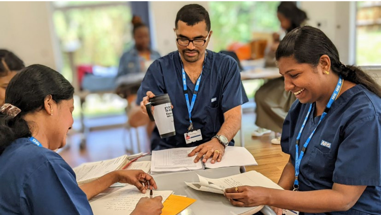
New International Recruits at Induction

Our values underpin all that we do: WE CARE • WE LEARN • WE EMPOWER